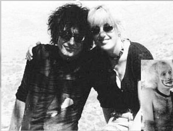
Bam and Share