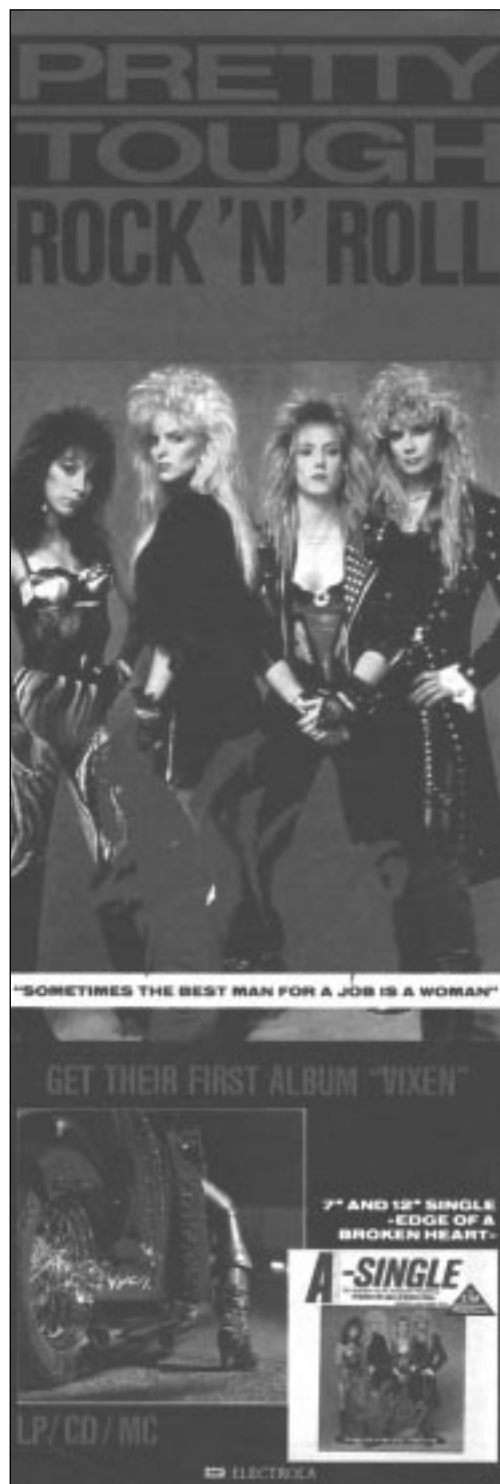
Ad from Germany. Metal-Magazine from 1988.