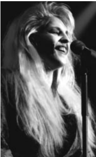
Janet Gardner in 1991 during their European Tour with Deep Purple.

Janet was born on March 17, 1962 in Juneau, Alaska. The voice was perfect for VIXEN and so Jan 'stole' Janet for her band.