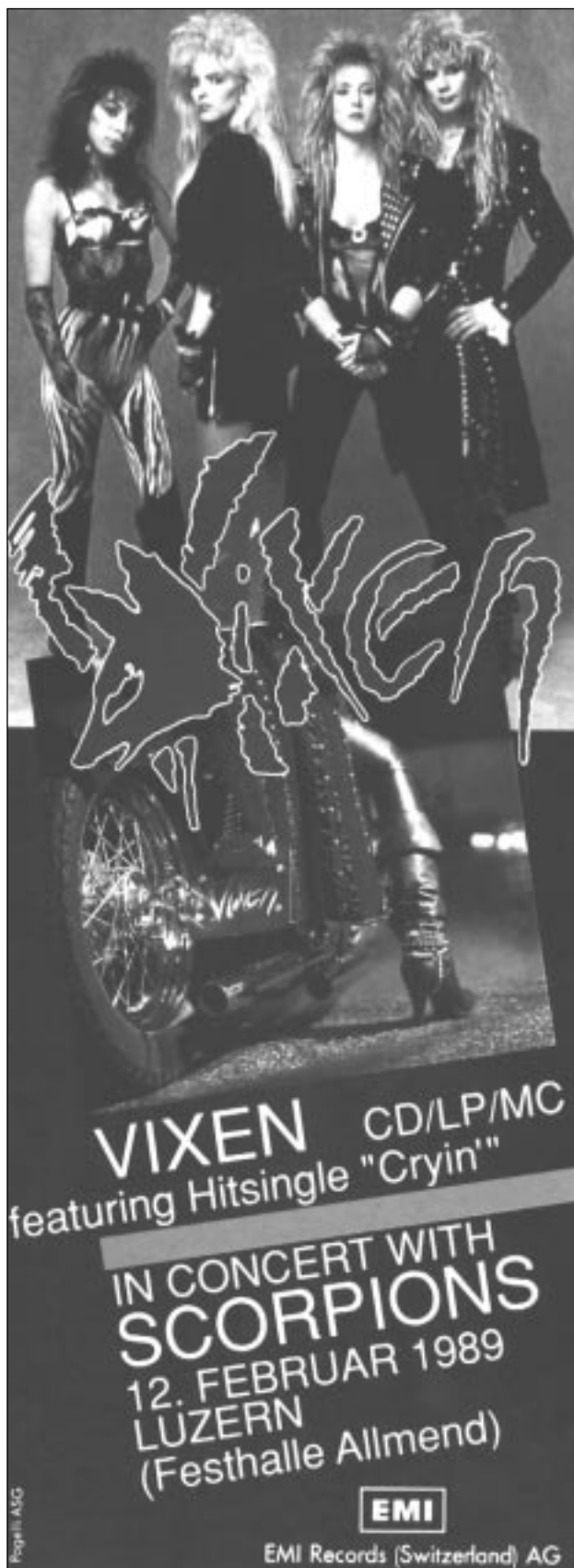
Early Ad from Switzerland/Europe 1989.