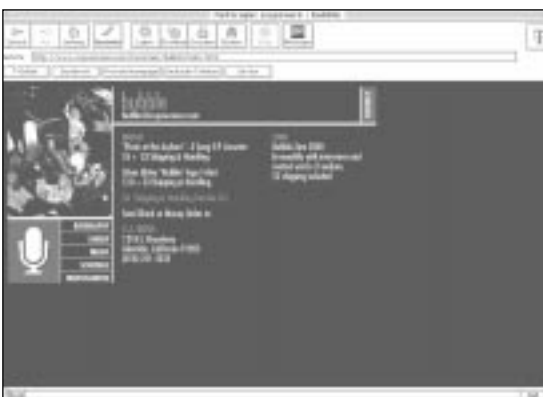
Merchandise with all the information you need...