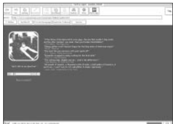
What the press wrote about BUBBLE