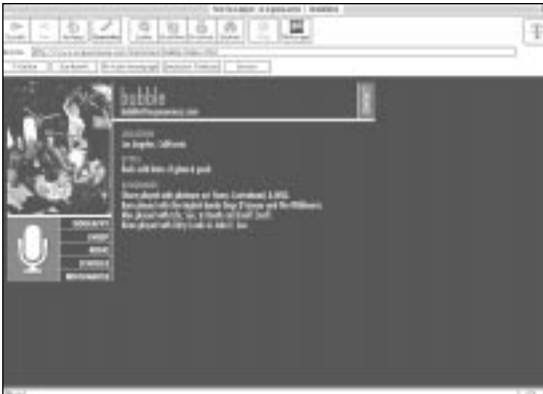
The first side when you „surf“ on Bubble...

A nice site for everyone who has the right plug-ins. If not - no problem you can download everything you need. You find information about the band plus tourdates and merchandise.