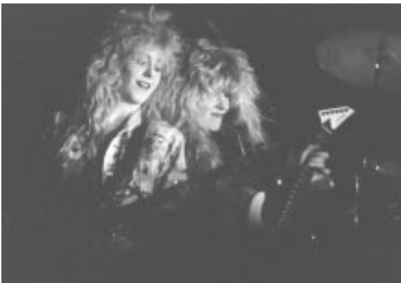
VIXEN Live in Germany 1989.

If you like to order this six pix or if you like to get his fantastic photo-list please write with IRC to: