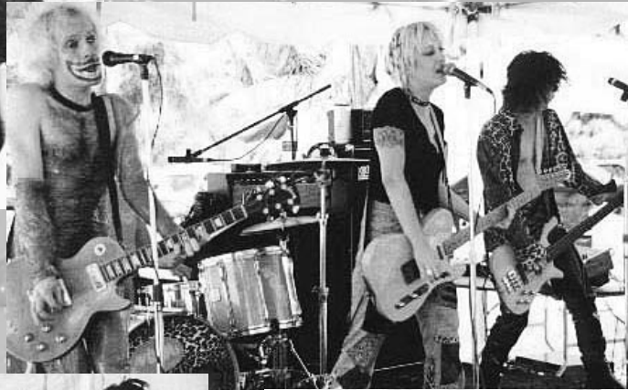
Bubble live on stage!