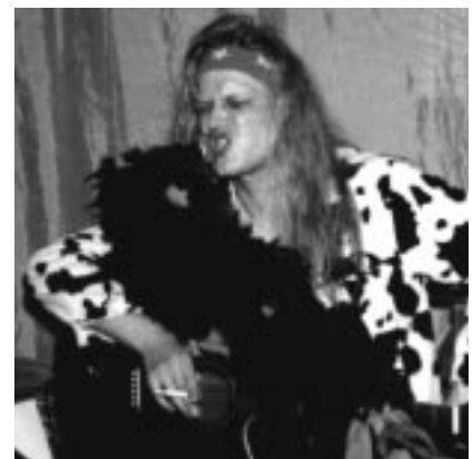
It's me during an unplugged gig in 1998 at our favourite club in Monheim called „Spielmann“.

If you want to know more let me know what it is.